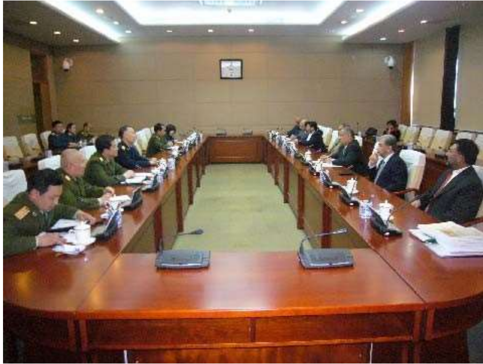
Meeting at the National Defence University, Beijing