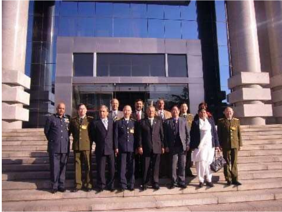
Group Photo at the National Defence University, Beijing