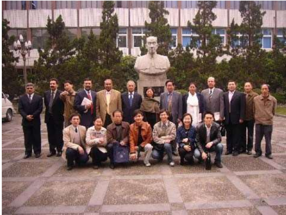
Group Photo at Sichuan University Chengdu, China