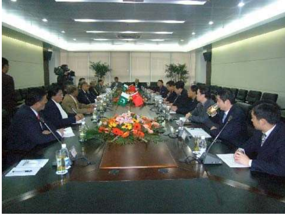
Meeting at Chengdu Aircraft Design and Research Institute