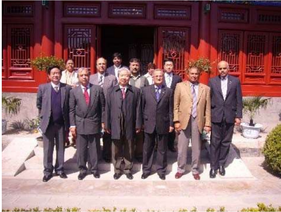
Group photo at Chinese Peoples Institute of Foreign Affairs, Beijing