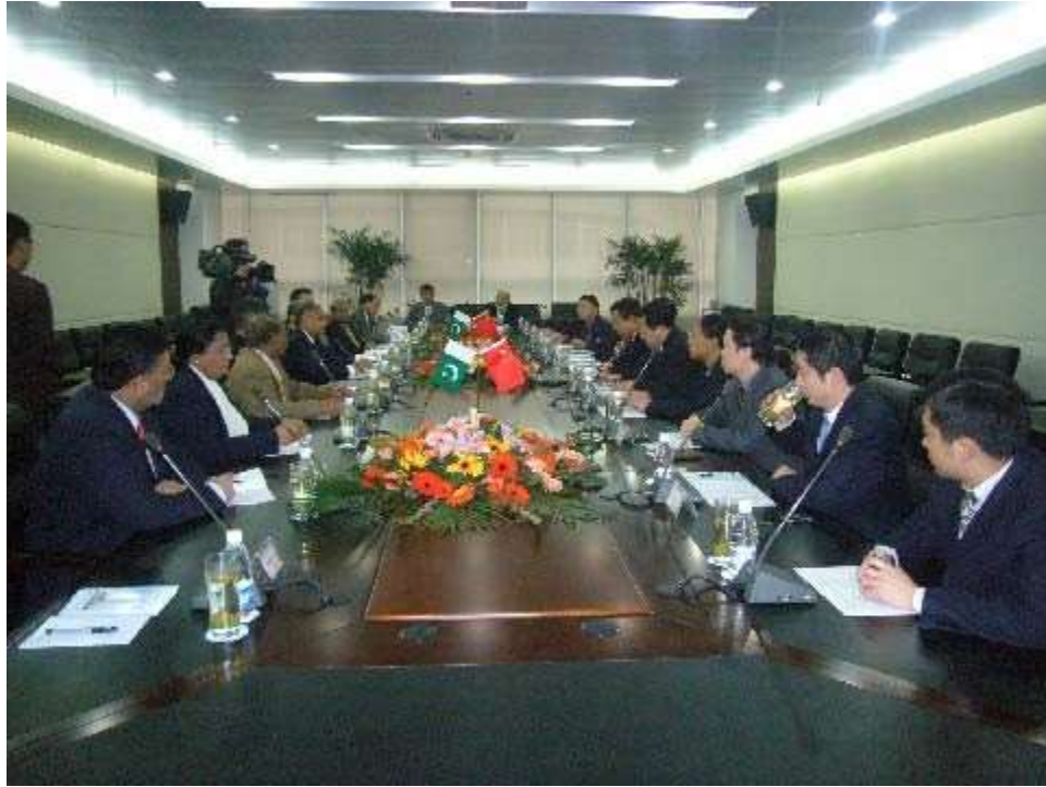
Meeting at Chengdu Aircraft Design and Research Institute