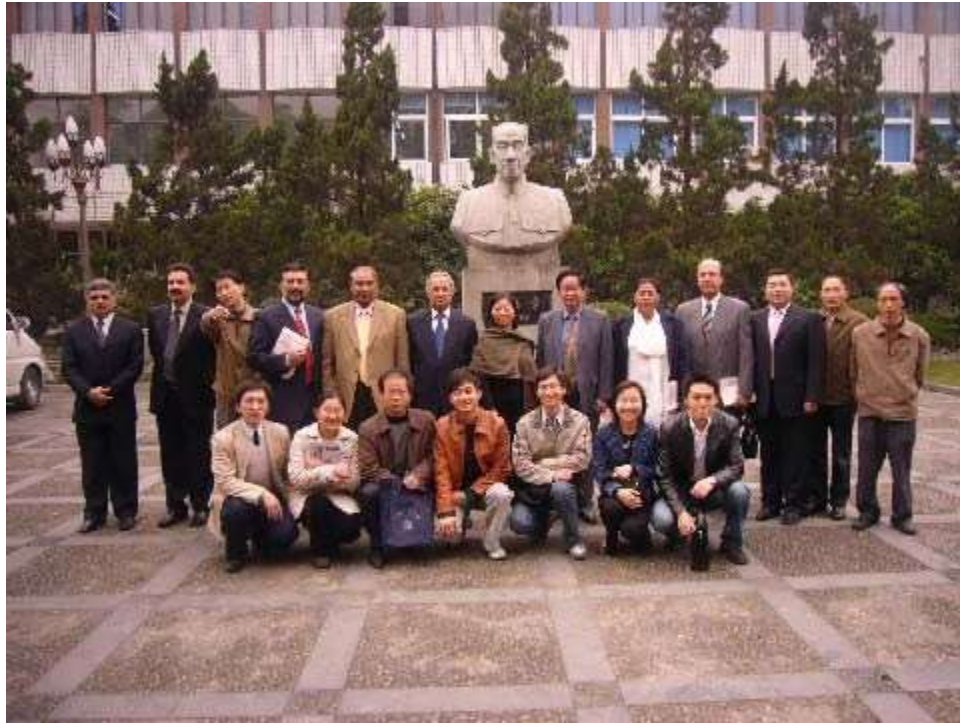
Group Photo at Sichuan University Chengdu, China