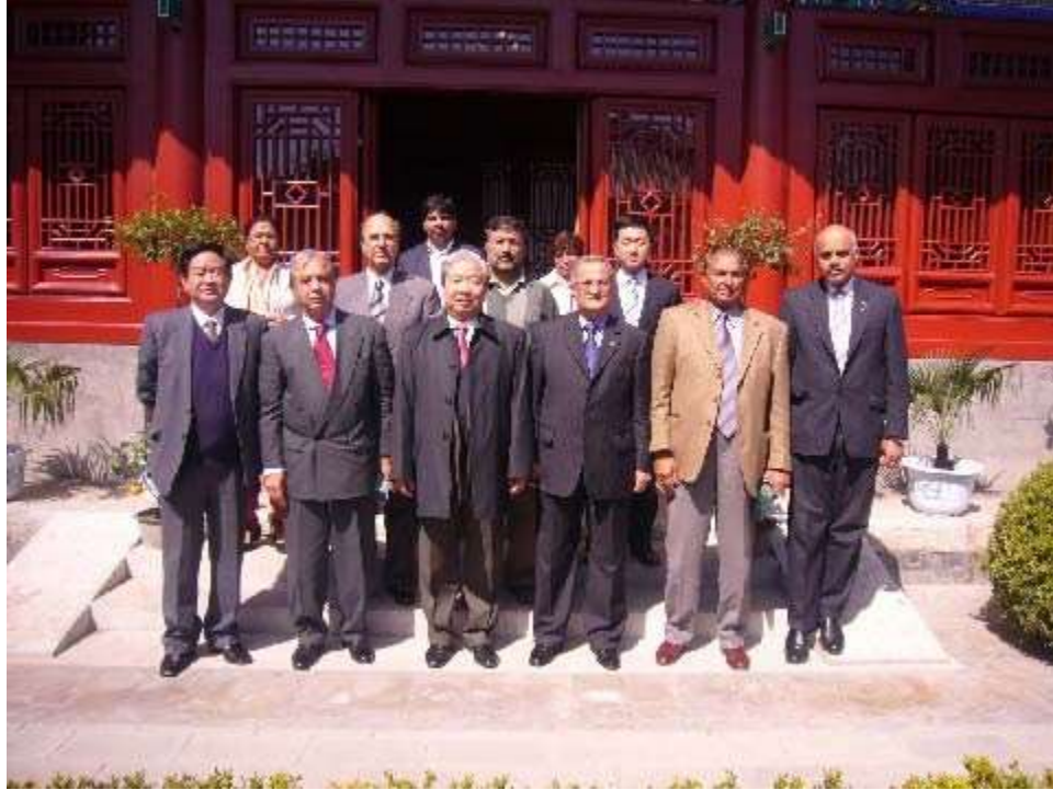
Group photo at Chinese Peoples Institute of Foreign Affairs, Beijing

Senator Memon said that one could recount numerous projects undertaken by China in Pakistan but the recently completed Gwadar Port and the historical Karakoram Highway commissioned during the 70's in the last century stand out as symbols of strategic partnership. He thanked Chinese authorities for sending 100 students to witness the Pakistan Day Parade on 23 rd March on which occasion 2 JF-17 aircraft also took part in the fly past. He informed the host that the decision to visit China was taken unanimously by the Members when the idea of foreign visit was mooted in the Committee.