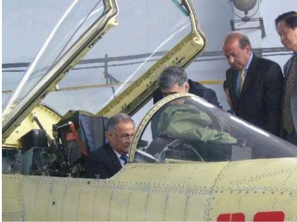
Senator Nisar A. Memon in the cockpit of JF-17 at Chengdu

Senator Nisar A. Memon thanked the management of the JF-17 manufacturing facility for organizing the visit and for a comprehensive briefing and discussion. He said the delegation was delighted to see a modern and high tech capability JF-17 aircraft being coproduced which demonstrates that Pakistan has strategic relationship with China based on consultation, coordination and cooperation and JF-17 is a good example of that relationship.